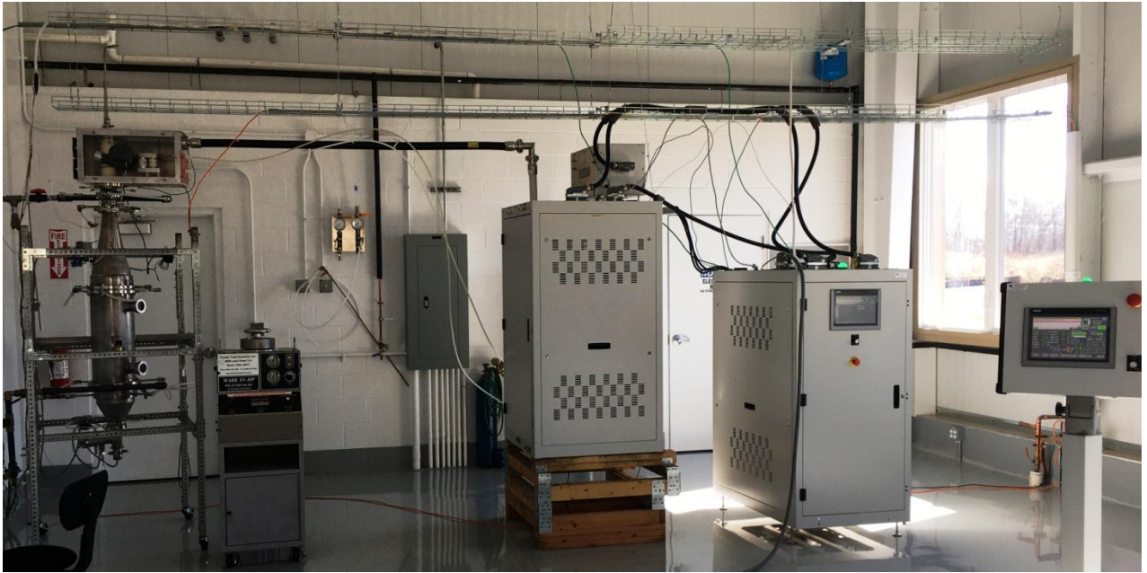
Fig.2. General view of the APT-125 plasma system for nanostructures production. APT facilities in Marshall, VA. June, 2023.