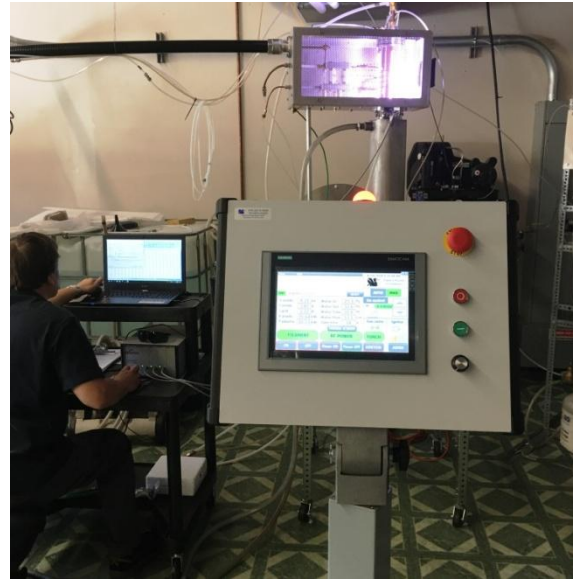
Fig.5. Torch operation and plasma diagnostics by optical spectroscopy