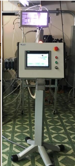
Fig.4. Remote operator's console